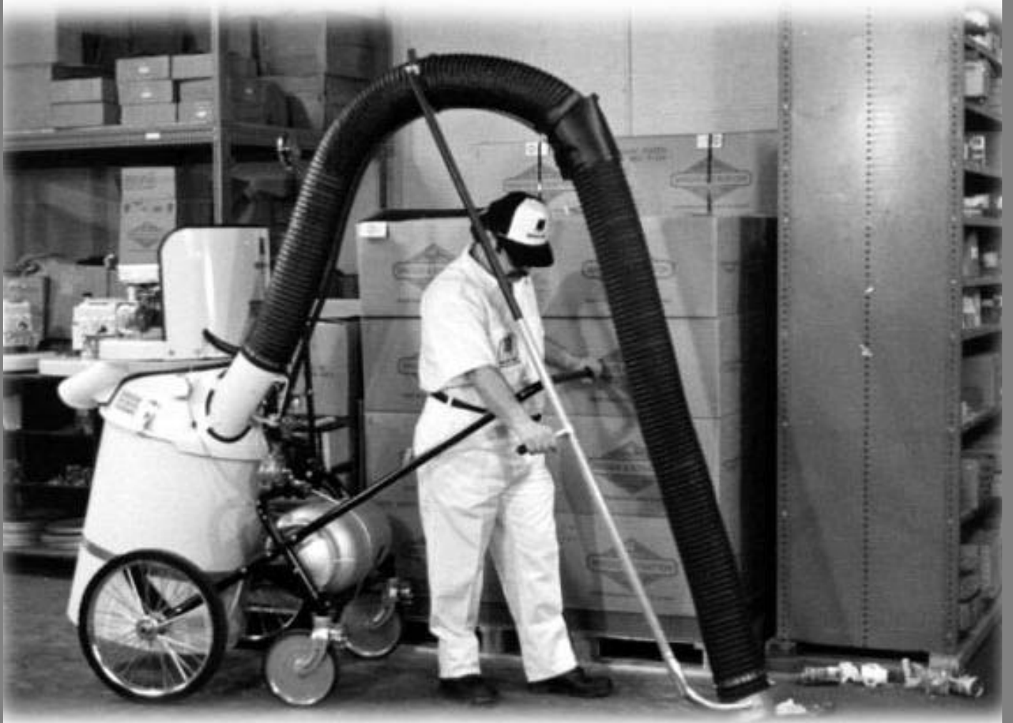
Elephant-Vac model 650-IP LP gas powered vacuum.

MODEL 650 & 850 PULL-AROUND INDUSTRIAL VACUUM